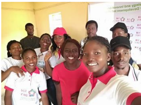
Oyo Location group in the Malaria outreach at Beere with the Managing Trustee.