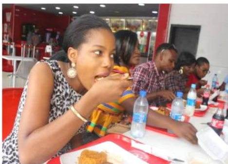
Abuja location group at lunch with the Trustee