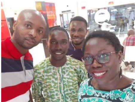
Surulere Location Group

Lagos Ikeja location group hosted the SI4DEV Managing trustee yesterday at JTT PARK Alausa. Lovely ambience coinciding with the Easter weekend event there and inspired quite the conversation. Summary: what project can we do to improve our community?