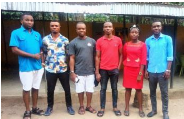
AKWA IBOM STATE OBOT AKARA