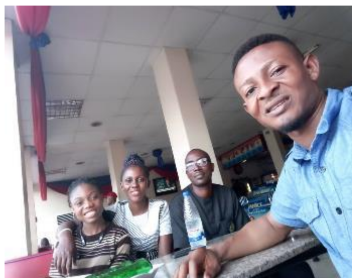
RIVERS PORT HARCOURT LOCATION GROUP