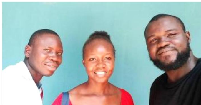
NIGER STATE, MINNA LOCATION GROUP

SI4DEV LOCATION GROUPS MEET EVERY MONTH TO DISCUSS SOLUTIONS TO COMMUNITY ISSUES AND PLAN PROJECTS