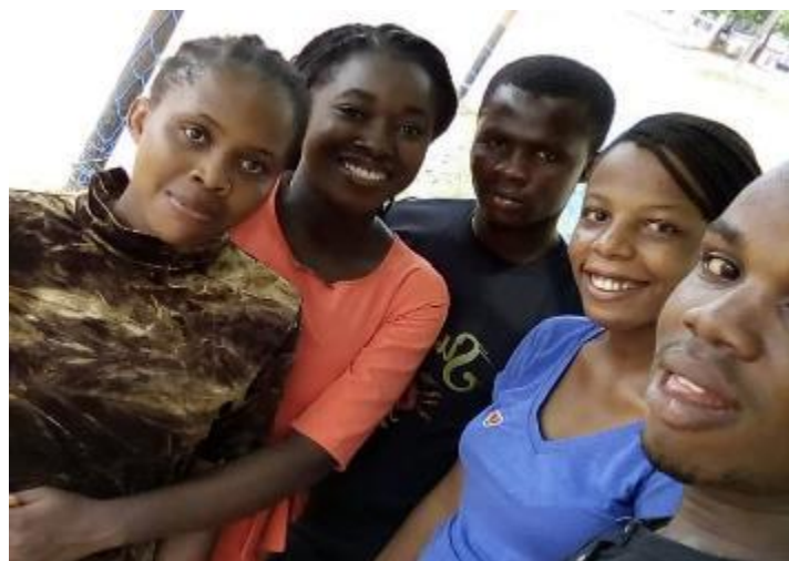
ANAMBRA STATE, NNEWI LOCATION GROUP