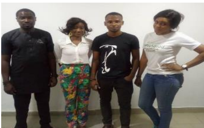
ABUJA LOCATION GROUP MARCH MEETING