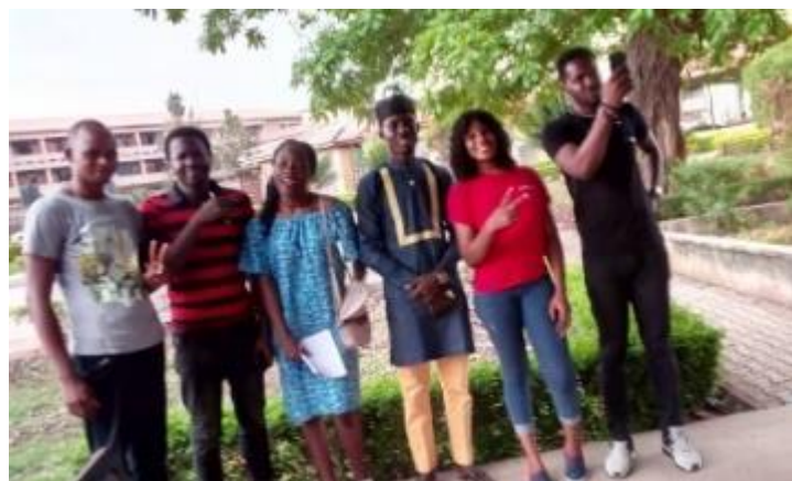
OYO STATE, IBADAN LOCATION GROUP